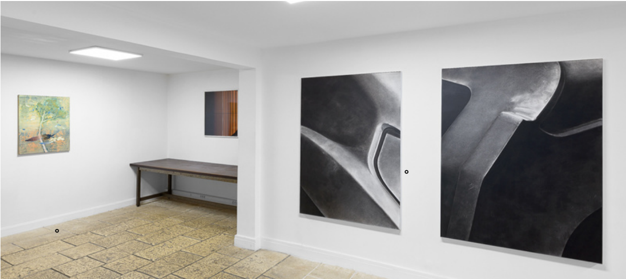
SUITE N°1, exhibition views, Galerie John Ferrère