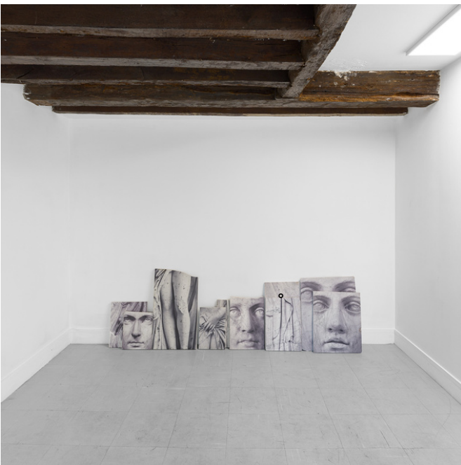
SUITE N°1, exhibition views, Galerie John Ferrère